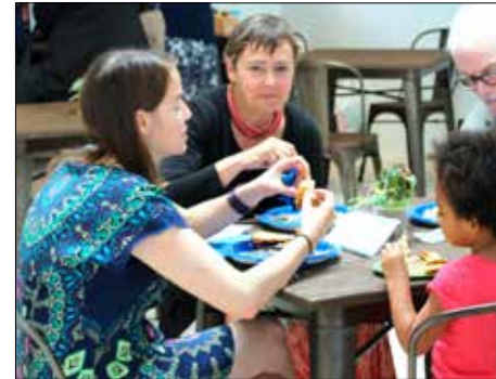
Alcott fundraiser attendees enjoying themselves.

Alcott staffers – slightly incognito - at the Santa Monica Lawn Bowls Club for a long day of lawn bowling for a great cause. The event benefited the Westside Coalition which is an alliance of 45 organizations, public agencies and faith communities committed to working collaboratively on issues of housing, hunger and health through service coordination, public education and advocacy.